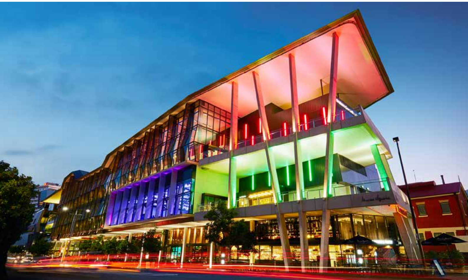
Brisbane Convention & Exhibition Centre